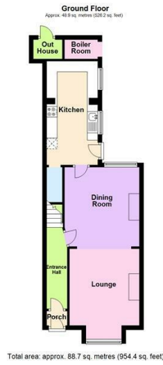
Total area: approx. 88.7 sq. metres (954.4 sq. feet)